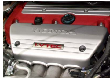
Honda 2.0 ltr K20 Motor

Power for the FRC-K20 is supplied by the Honda K20 engine (Civic Si). All that power is transferred to the rear wheels through the Elite TXL-250 6 speed transaxle. The transaxle features sequential shifting, limited slip and reverse.