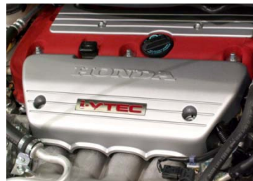
Honda 2.0 ltr K20 Motor

Power for the FRC-K20 is supplied by the Honda K20 engine (Civic Si). All that power is transferred to the rear wheels through the Elite TXL-250 6 speed transaxle. The transaxle features sequential shifting, limited slip and reverse.